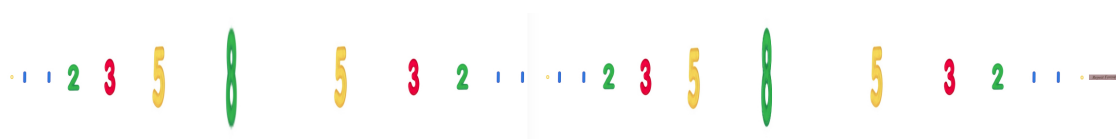
image on the back:

Note: I want to make use of a more inclusive language. For example, people with reduced mobility may move or roll instead of "step". Or else, to include people that can't hear or speak may participate through other senses, making sounds with objects or even with their imagination. Wanting to simplify the list of instructions, these inclusions were left out, but could be interesting to integrate them once again. This is up for discussion.